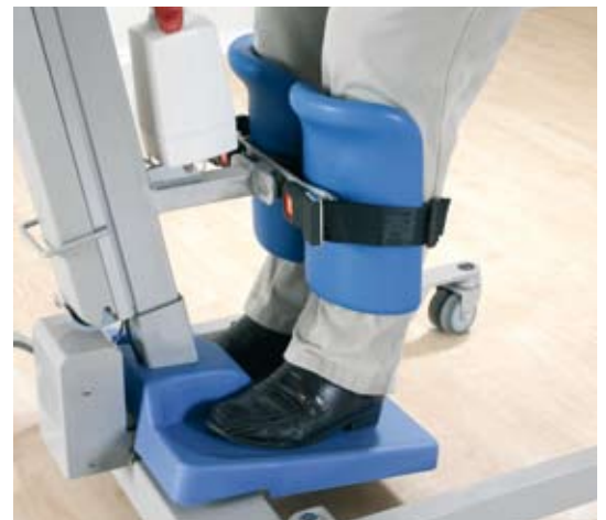
The footplate provides optimum safety and stability, while the kneepad allows natural flexion of the ankle.