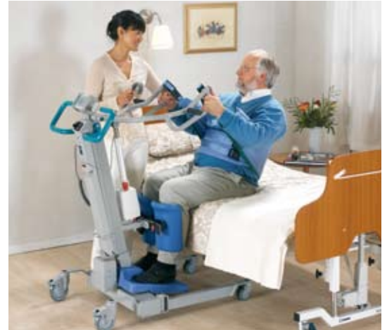
Using SARA 3000, a single carer can raise the resident into a standing position, comfortably and securely.

SARA 3000 makes carers' work easier. It enables safe transfers to be carried out by a single carer, because it completely eliminates manual lifting. The machine raises the resident to a standing position while providing optimum upper body support. Ergonomic design makes SARA 3000 simple and comfortable to operate and control. Easy operation via the handset or mast panel supports safe, efficient transfers, which means the carer can devote more attention to encouraging the resident's active participation in the transfer routine.