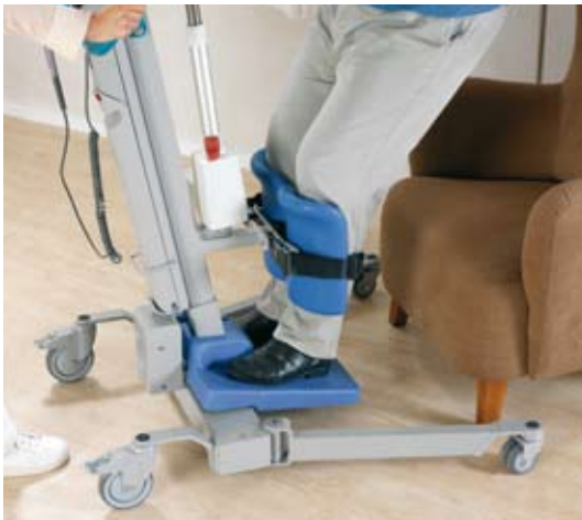
The powered chassis opens to provide optimum access for transfers. A wheel-lock mechanism secures the machine during raising and standing routines.