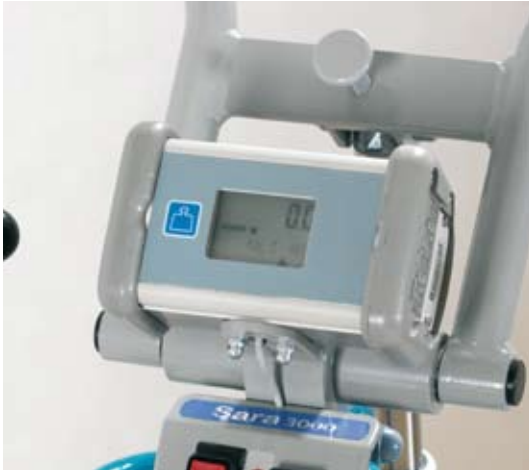
The optional integrated scale saves time by weighing the resident during a transfer.