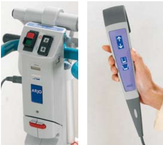
Dual controls. Handset or mast panel control? The carer can choose the most convenient control according to the situation.