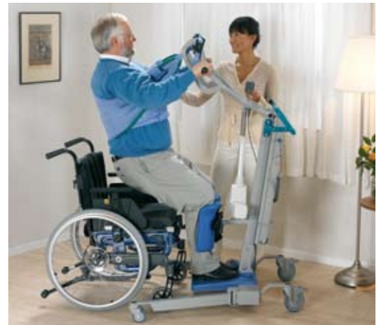
Transfer to a wheelchair is performed smoothly and under close control.